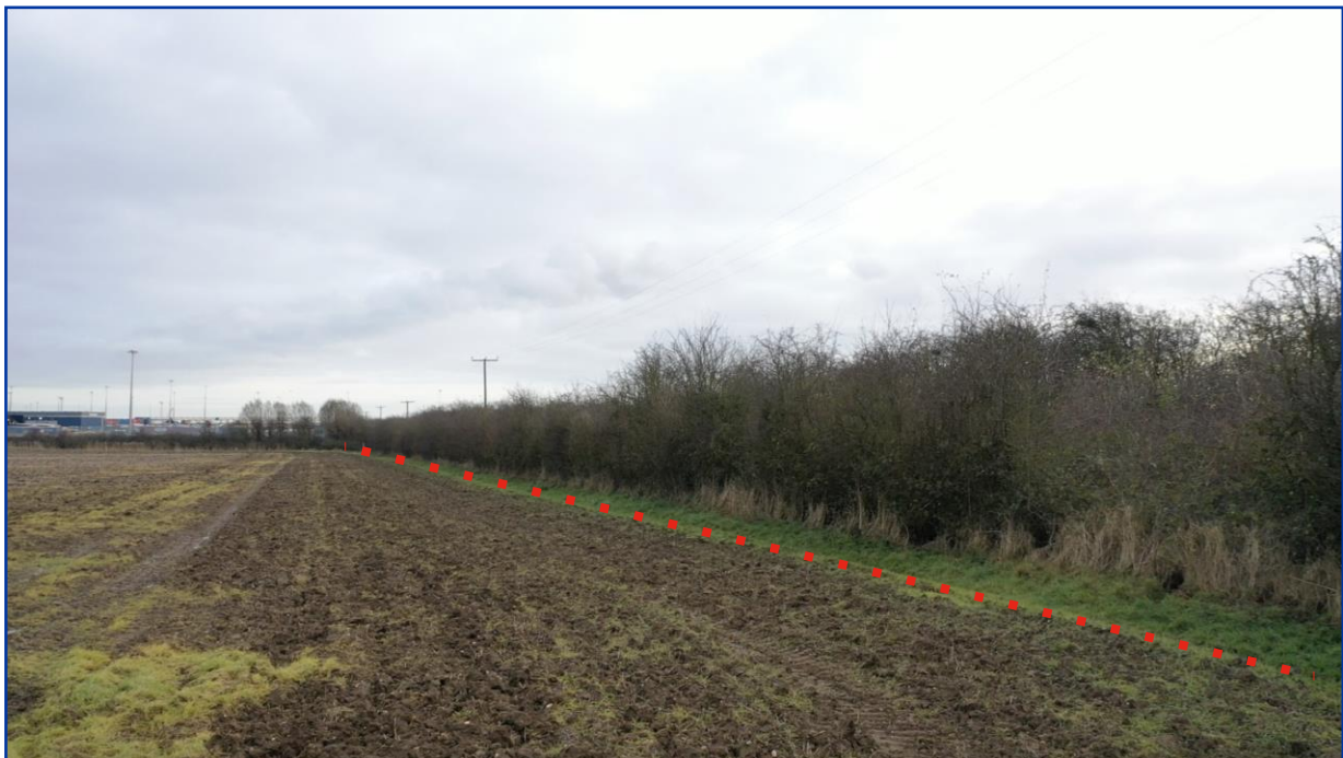
Proposed Footpath down from Agricultural Crossing