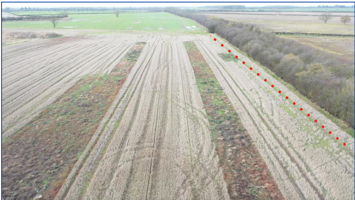
Proposed Footpath up to Agricultural Crossing