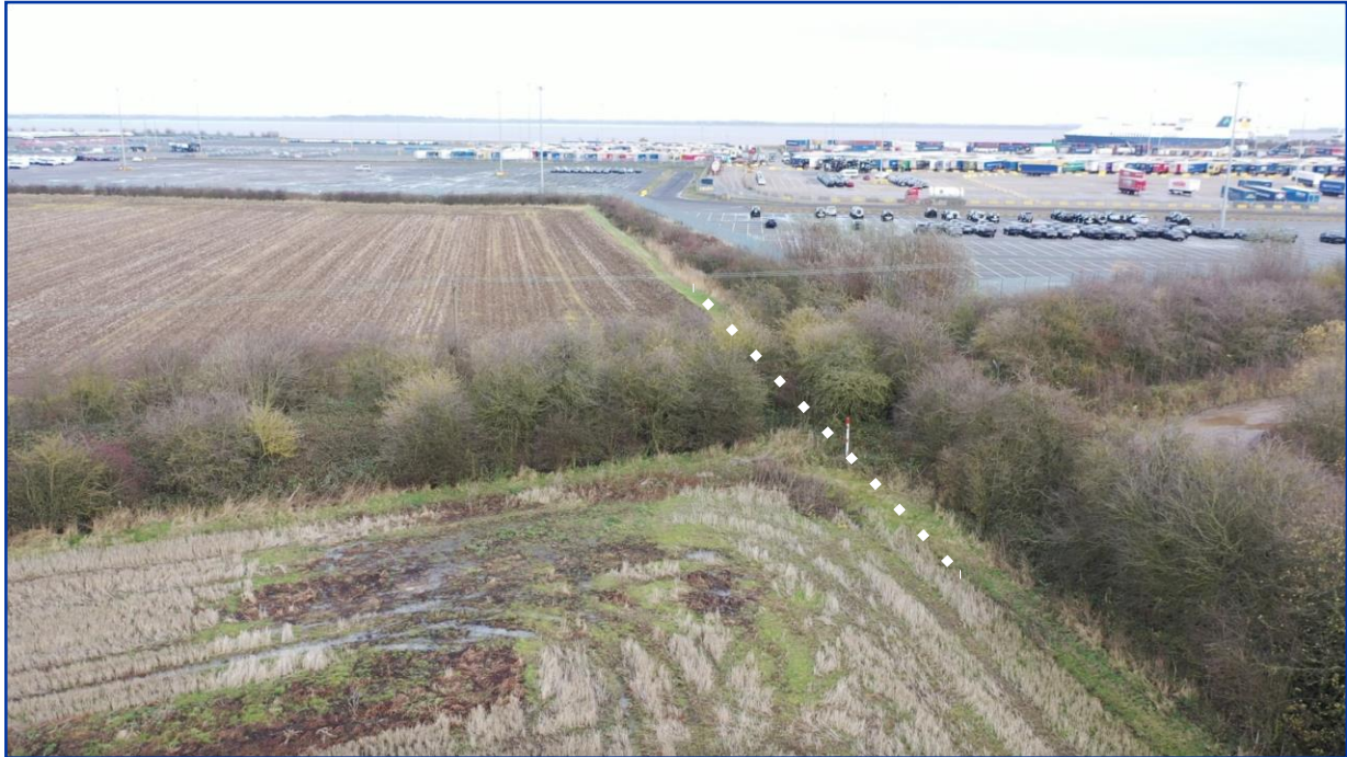
Consented Rail Crossing Point